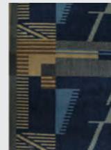
Seat cloth for the Ikegami-maru (ship) of O.S.K. Lines, Ltd.