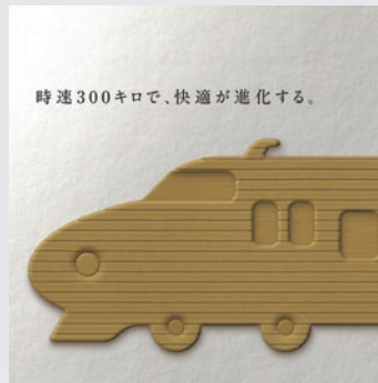
April issue Seat covering for Green Cars of the 0-series Shinkansen bullet train