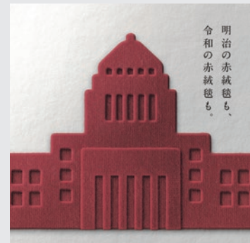
May issue Red carpet for the National Diet Building