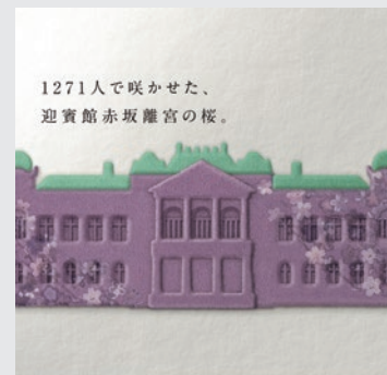
October issue Carpet for “Asahi no Ma” of the State Guest House, Akasaka Palace

* Each advertisement was first published in the issue that is indicated under the advertisement.