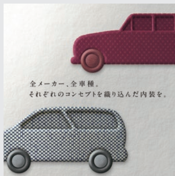
June issue Automotive seat coverings