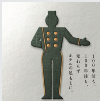
August issue Hotel carpet